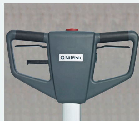
Ergonomic handle, with smooth round edges, easier operation and less fatigue