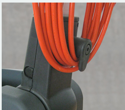
Cable hook for greater comfort